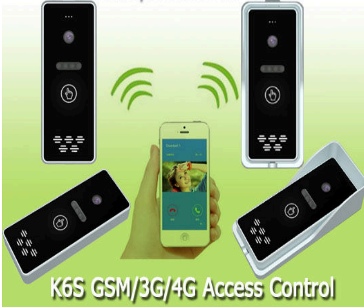
K6S GSM/3G/4G Access Control

Dial to open the door with a free charge call! Remote open the door for visitors.